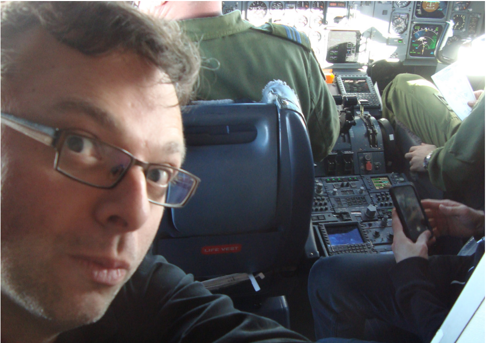
In the cockpit of a Hercules aircraft coming back from the North Pole.