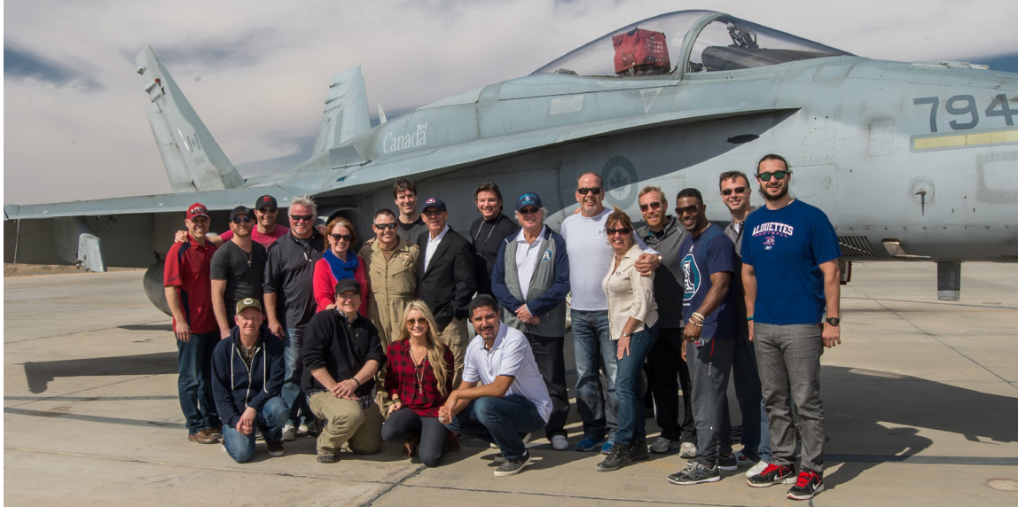
The show tour cast in front of one of the military's jet planes in Kuwait.

be a performer and entrepreneur. You'll need to develop and hone a few very specific market-based abilities and tactics, build your relational skillset, and get ready to triage those entertainment battle scars.